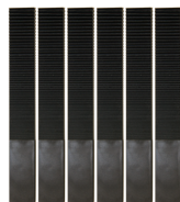
Screws, Anchors and Shims (6 each)